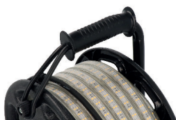
Handle with integrated elastic band to lock the cable reel

The LED stripe is supplied ready for connection with 25 meters on a cable reel or 5 resp. 10 meters on cable unit. The mains connection is made using the supplied connection cable. The FlexLED light stripe can be connected quickly and easily and thus be extended to a maximum length of 100 m.